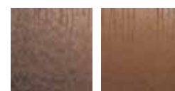
Timber Brown Sequoia

TerraFence™ is offered in two popular standard colors: Timber Brown and Sequoia.