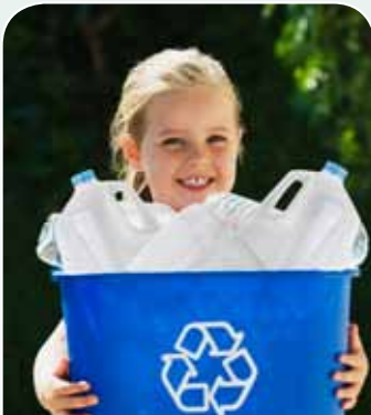
Eco-friendly Products Utilizing Recycled Plastics